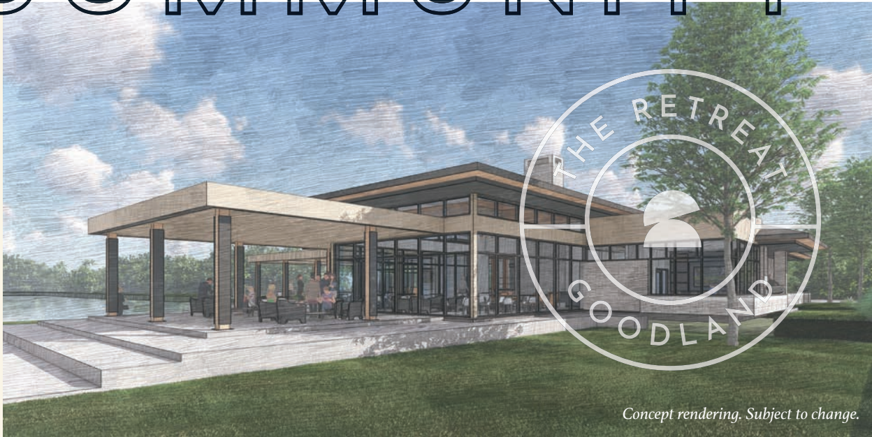
Concept rendering. Subject to change.

A signature amenity and gathering place that will connect all to trails, water, nature and community. Opening in 2025