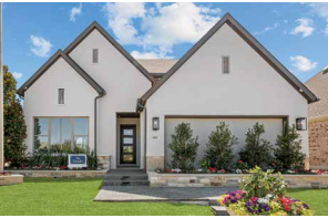
DAVID WEEKLEY HOMES From the mid $300s