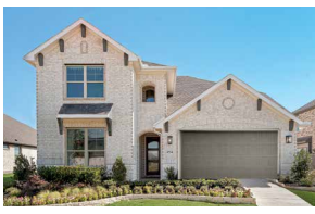
HISTORYMAKER HOMES From the high $300s