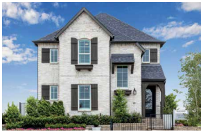
HIGHLAND HOMES From the mid $300s