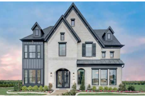
GRAND HOMES From the mid $400s