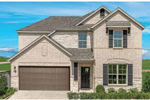
BEAZER HOMES From the high $300s

Now selling in Prairie Ridge and Feather Grass villages.