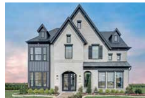
GRAND HOMES From the mid $400s