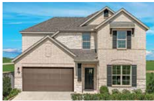
BEAZER HOMES From the low $400s

Now selling in Prairie Ridge and Feather Grass villages.