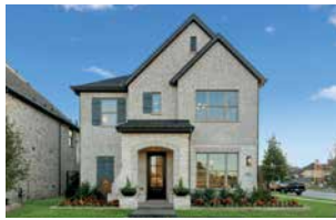
DAVID WEEKLEY HOMES From the mid $300s