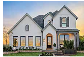
HIGHLAND HOMES From the mid $300s